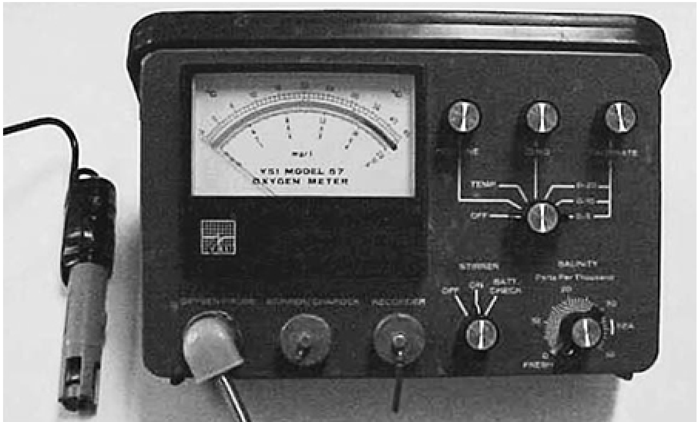
Fig. 2: Polarographic dissolved oxygen meter and probe. Since the connection between the cable and probe tends to wear, this probe is taped for greater longevity.