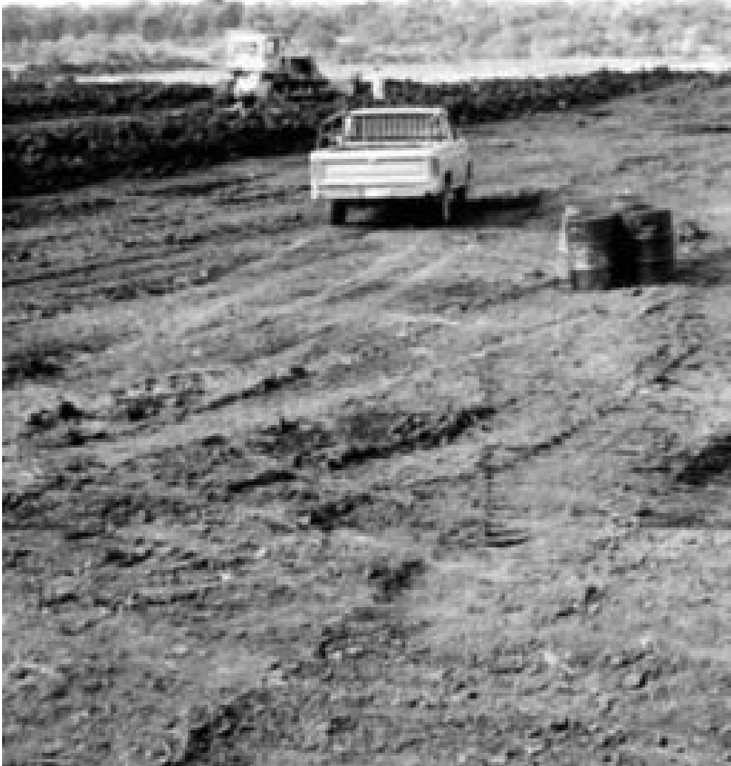
Embankment ponds are made by digging soil from the bottom to build up levees.

Inland pond aquaculture usually has a greater effect on local hydrology than other types of aquaculture, because water may be removed or diverted from natural water bodies for filling ponds and maintaining water levels.