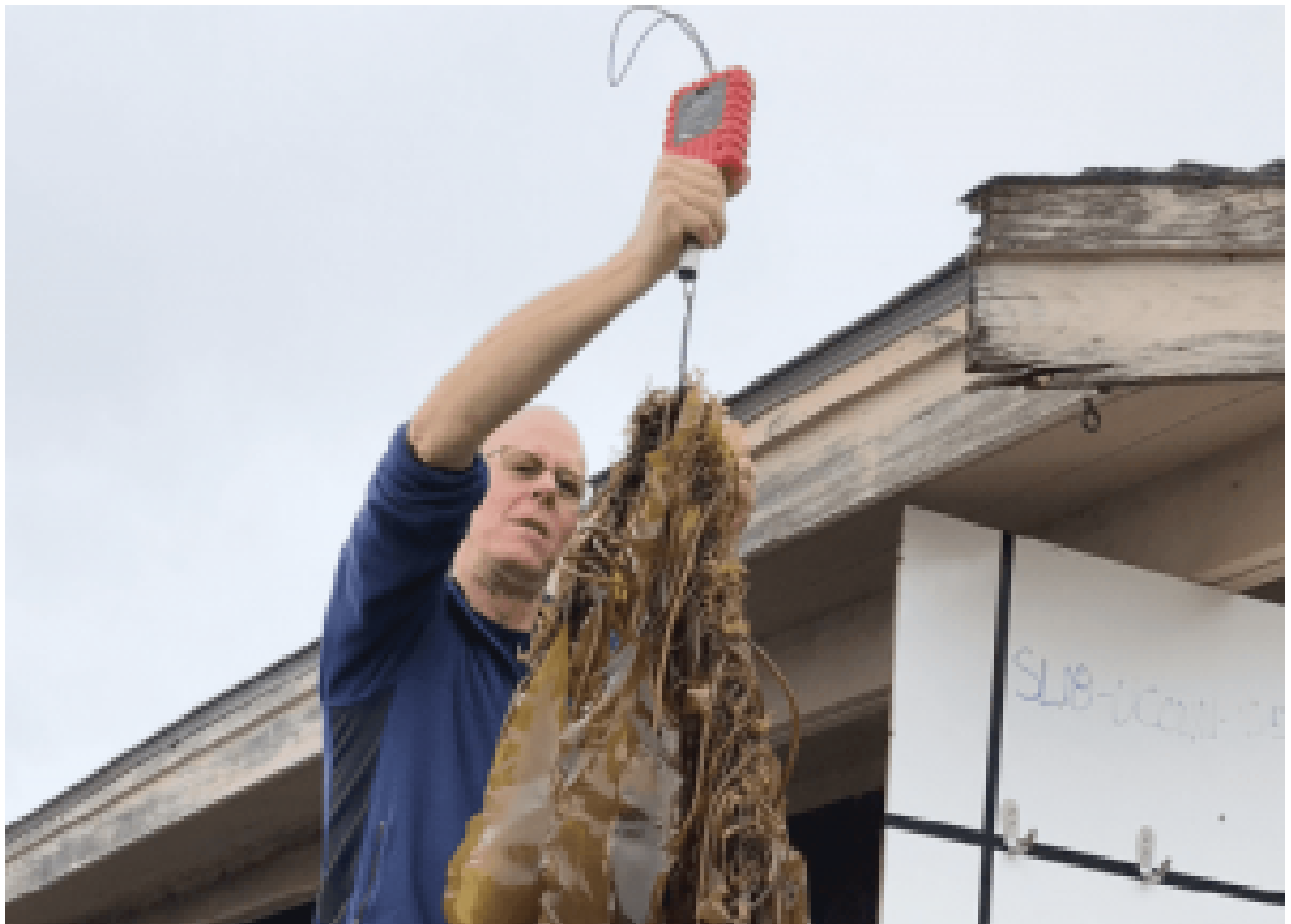
The Woods Hole Oceanographic Institution and the World Wildlife Fund will test sugar kelp strains and measure the yield and quality of new strains.

With support from the Bezos Earth Fund, breeding study seeks to develop new strains