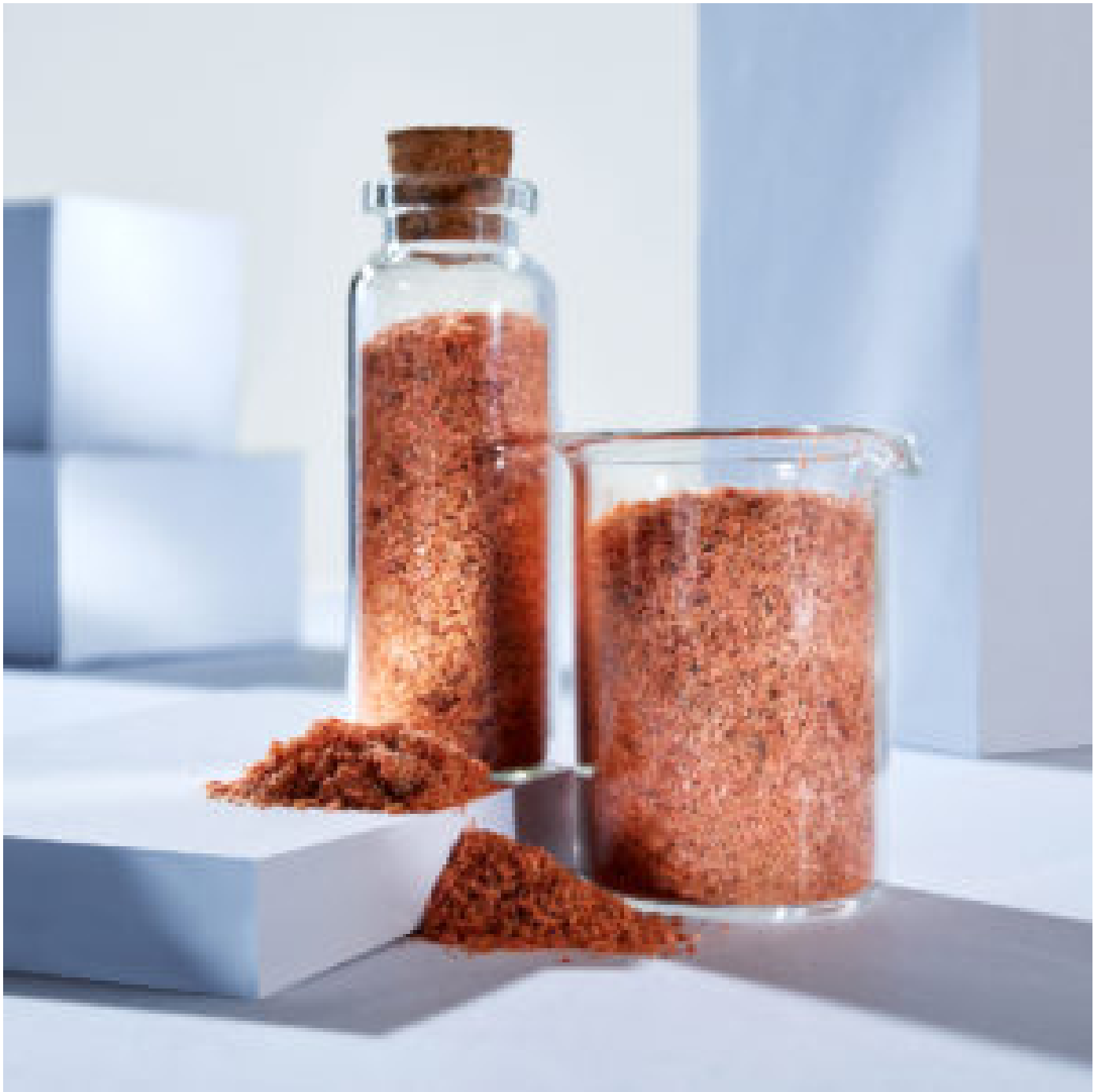
Aker BioMarine's Krill Aqua meal, produced from whole, fresh-caught and dried Antarctic krill, can be applied with various species of cultured fish.